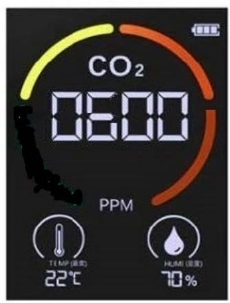
GREEN CIRCLE SECTION FLASHES UPTO 700 ppm