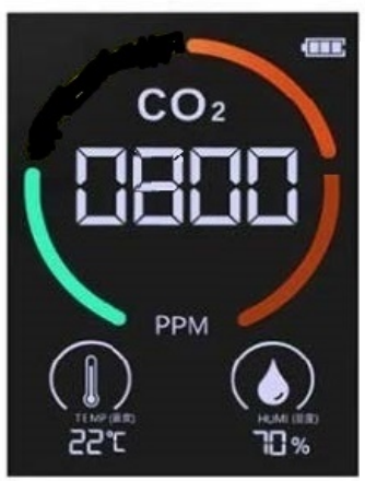
YELLOW CIRCLE SECTION FLASHES 701-800 ppm