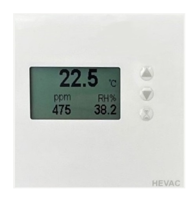
NEW HSMO SERIES MODERN AESTHETIC ROOM SENSOR'S WITH TEMP., CO2, HUMIDITY OUTPUTS + LCD DISPLAY, S/P & AHR BUTTON