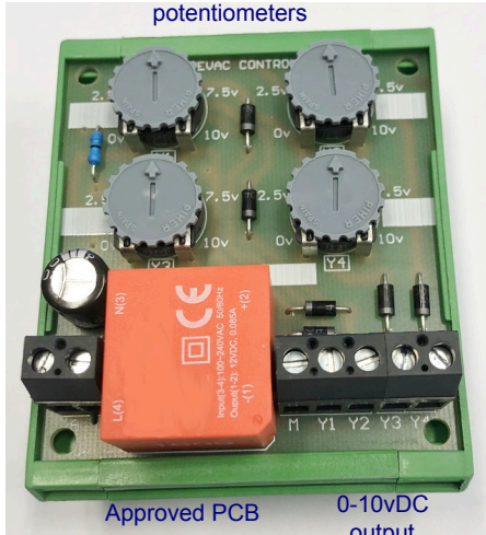
Output setting potentiometers